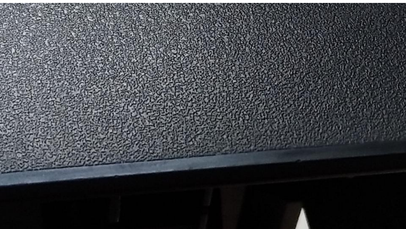
Texture blend polish.